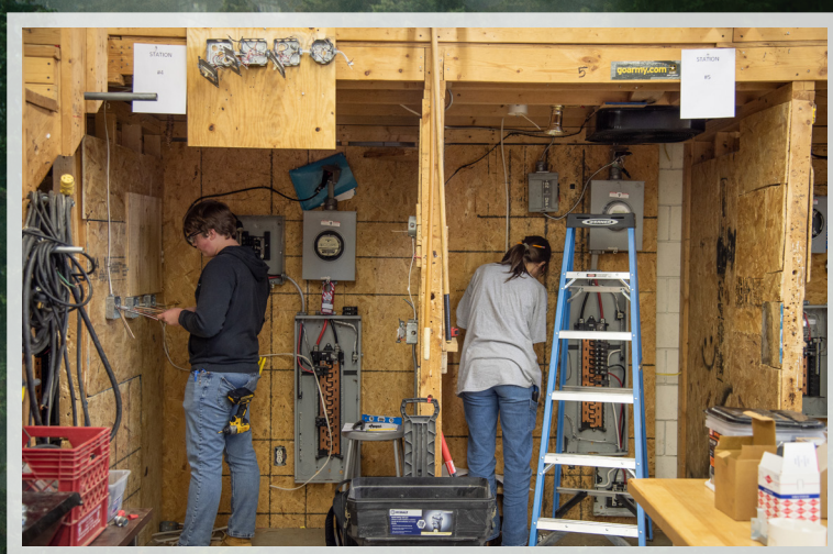
Electrical Competitions consisted of Industrial Motor Control and Residential Wiring. Students pictured here are competing in Residential Wiring.