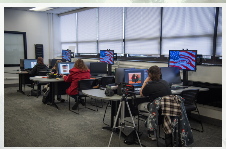
Multimedia hosted competitions for Advertising and Design & Photography!