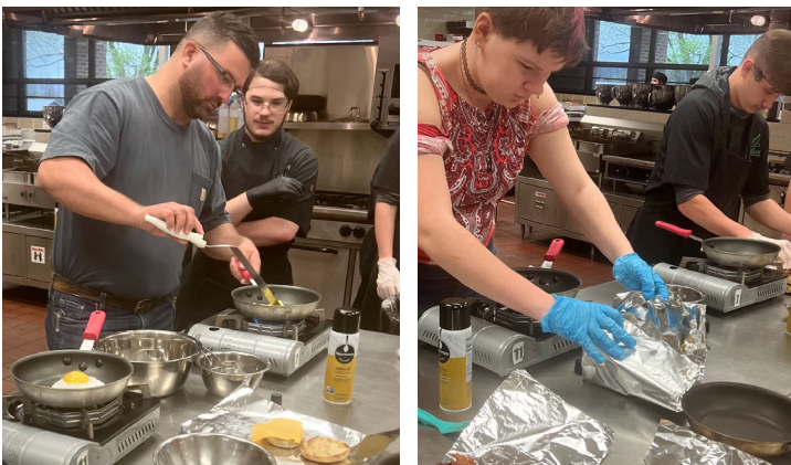
Agriculture and Culinary making breakfast sandwiches with fresh eggs!